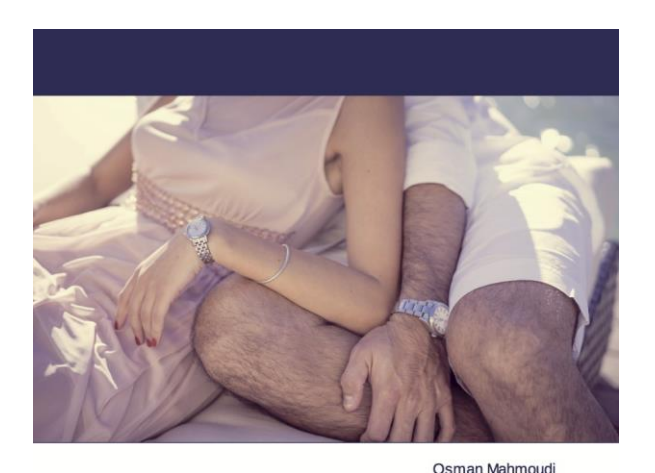
Comparisons Mental Health, Sexual Functioning and Marital Satisfaction of Couples Victims of FGM and Other Couples

women who have not undergone FGM. Read more in our article "<u>New Study from Iran:</u> <u>Female Genital Mutilation Impedes Men's Well-Being</u>".